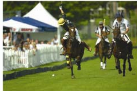
Neighbors to the Point Clear Polo Fields