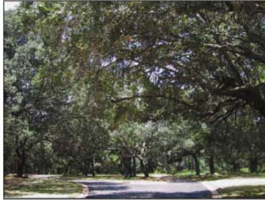
Point Clear Tennis & Swim Club Road Ways

T he Point Clear Tennis Club has traditionally been the landmark social, tennis and swim club of the Point Clear and Fairhope area. Its tree draped lawns and ivy clad structures add to its old world charm and provide the perfect setting for an active family lifestyle.