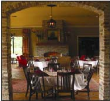
Clubhouse Dining Room